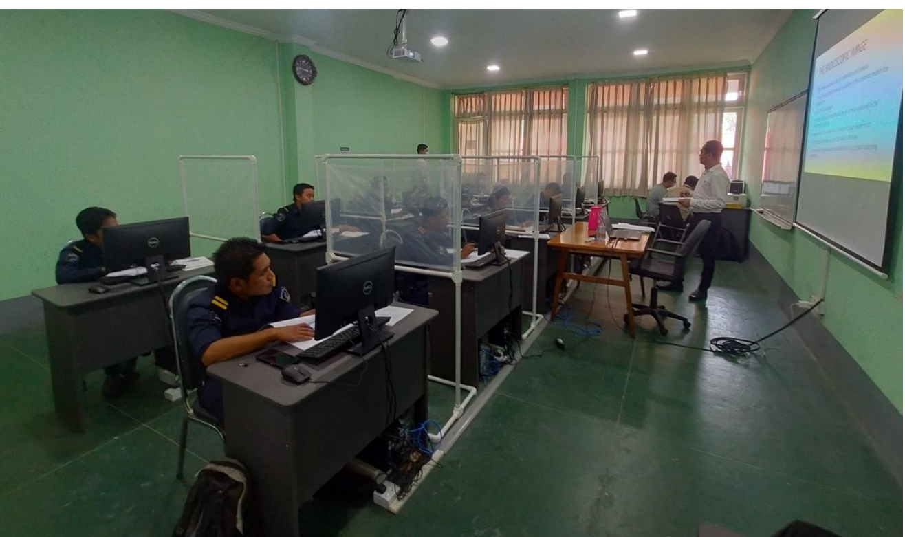
X-Ray Operator CBT course