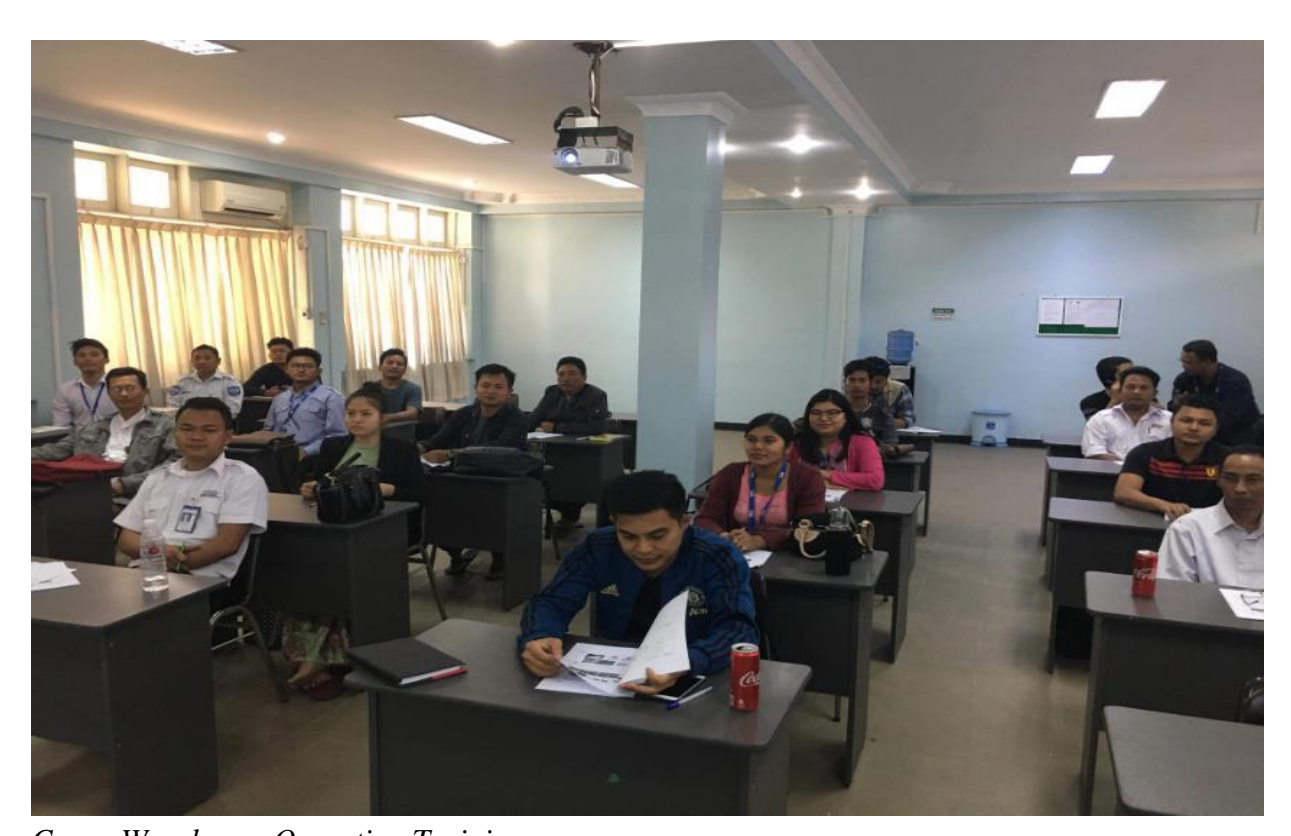
Cargo Warehouse Operation Training