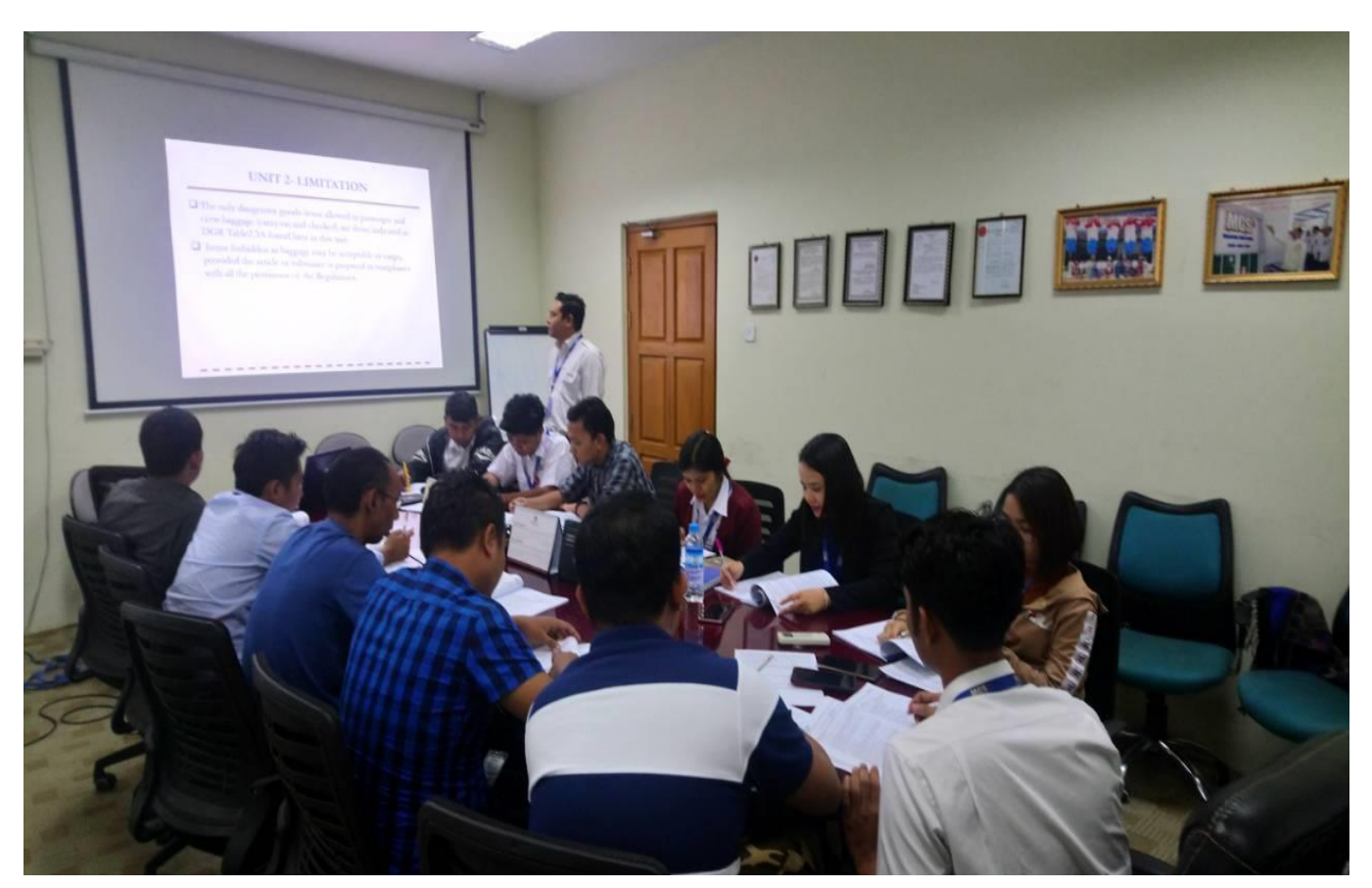
Dangerous Goods Regulation Training Cat 8(Recurrent)