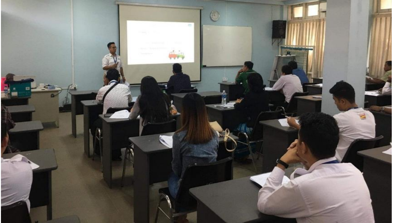
Warehouse Safety Training

Under new program, let workers to know about knowledge, information and worker rights by supporting respective books and annual seminar on warehousing, health care, workplace security and others.