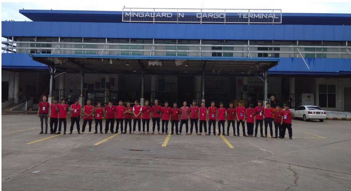
MCS staff Cleaning Day on every Sunday for Environment